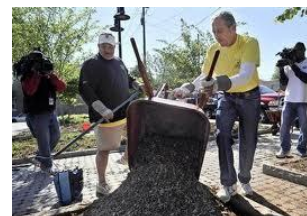
Seeds for the Future 2011 Community Day Video