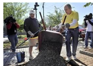
Seeds for the Future 2011 Community Day Video