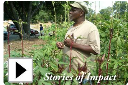
Truly Living Well Wheat Street Garden